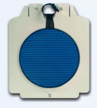
Soft transfer disc

The turntable with sliding extension has additionally a rail that is clicked underneath the disc and enables the transfer from the edge of the bathlift to the centre of the bathlift seat.